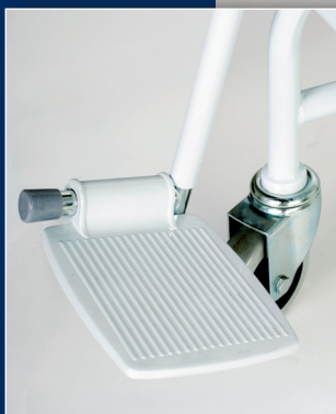
Lift Up Swivel Foot Rests