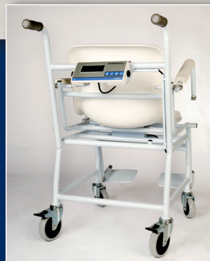
300 kg Capacity