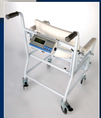
Rugged Heavy Duty

Newcastle Weighing Services Pty Ltd 104 - 114 Hannell St WICKHAM NSW 2293 PH 02 49614554 FAX 02 49621137 W: www.nws.com.au