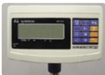
Easy to read and operate indicator

* If scale is NSC certified for trade use * accuracy applies. ** A platform size of 300mm x 400mm is also available.