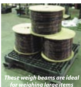
These weigh beams are ideal for weighing large items

■ The MIL 589 Weigh Beams can be separated to allow any item to be weighed. Due to their versatility and portability they are ideal for weighing materials and products of various sizes and can also be installed in a fixed location.