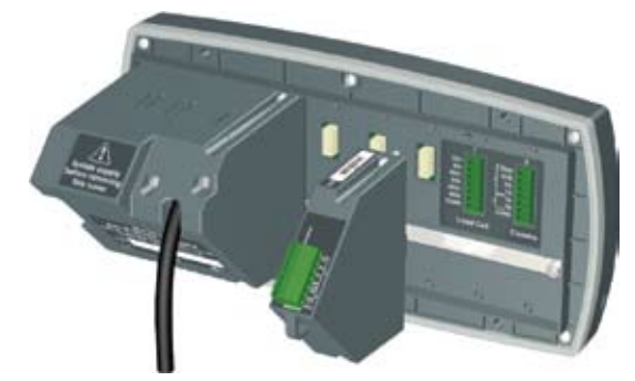
R420 with modules