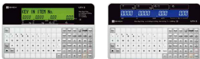
L2 TYPE DISPLAY

The UNI-3 model variants are available with two display types: The UNI-3 L1 models have a blue backlite display with sharp white 16-segment display capable of showing momentarily the PLU name and swap to numeric data; The UNI-3 L2 models, come with a two-line green/orange backlite liquid crystal display, one line dot matrix alphanumeric and one line numeric only.